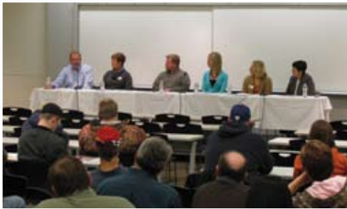
Careers in Demand Employer Panel

In addition to the event, students and parents were provided with information on career opportunities in manufacturing and healthcare through informational flyers highlighting career opportunities, position descriptions, and wage ranges. These publications were distributed to the family of each student in 7-12 th grade as well as to teachers and schools throughout the RAED District.